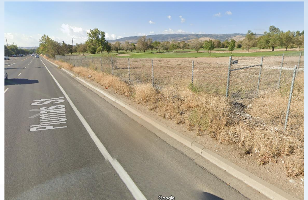
Existing Conditions on Plumas Street South of Reno Tennis Center